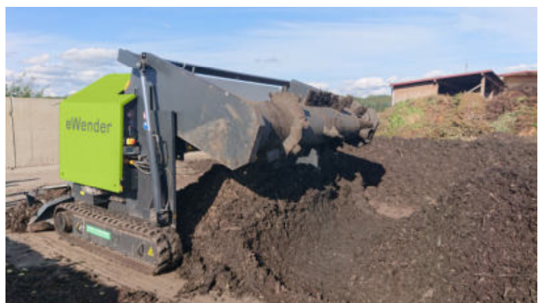
Rotor lifts up to 90°